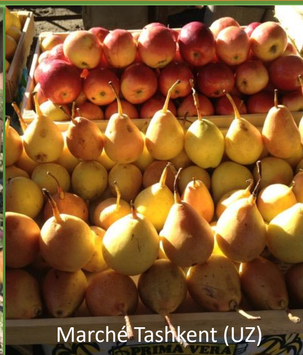
Marché Tashkent (UZ)